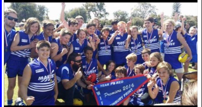
Footys will be out for a kick with your mates

Come join the winning team! Marist Registration Day 12/2/17 at 9am-12 pm To be held at the Marist Junior Football Club rooms, Albert Oval Bunbury Catholic College