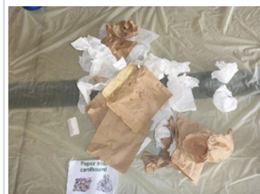
Not Nude Food Day