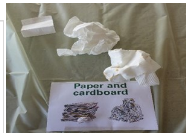
Nude Food Day