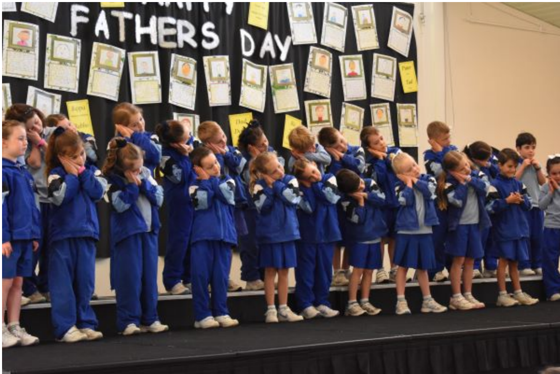
Year 1 Assembly