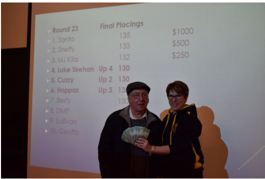
Footy Tipping Wind Up