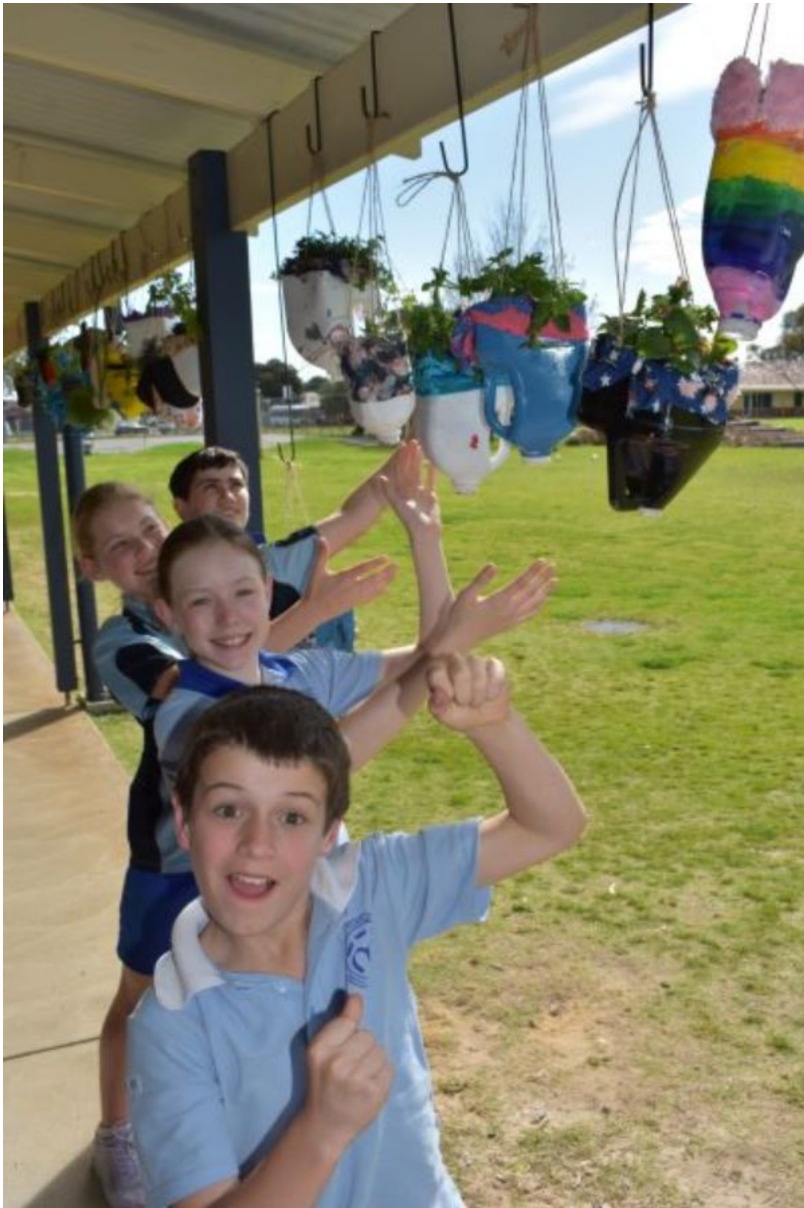
Decorative Pot Making Year 6