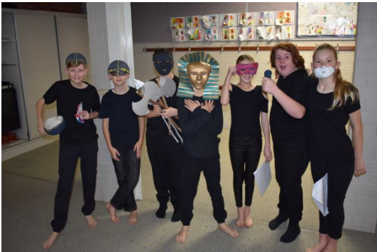
Optiminds -Year 5 and 6