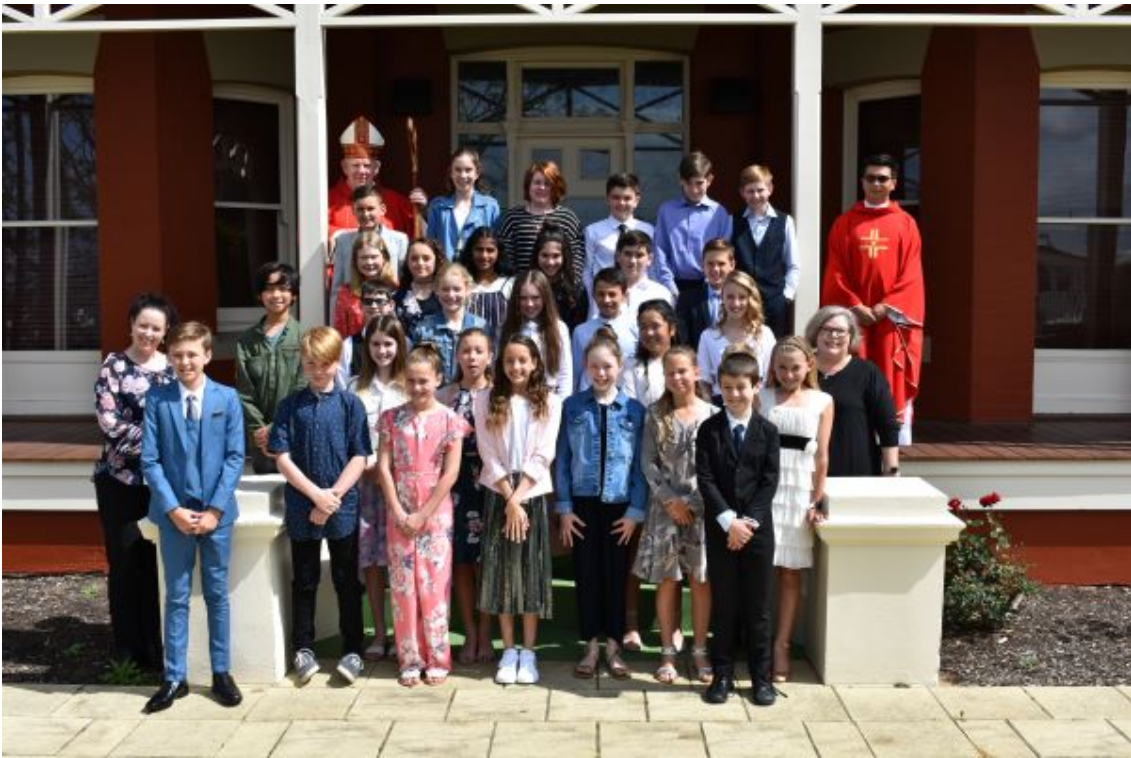
Year 6 Confirmation